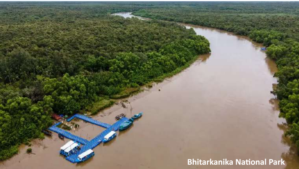
Bhitarkanika National Park