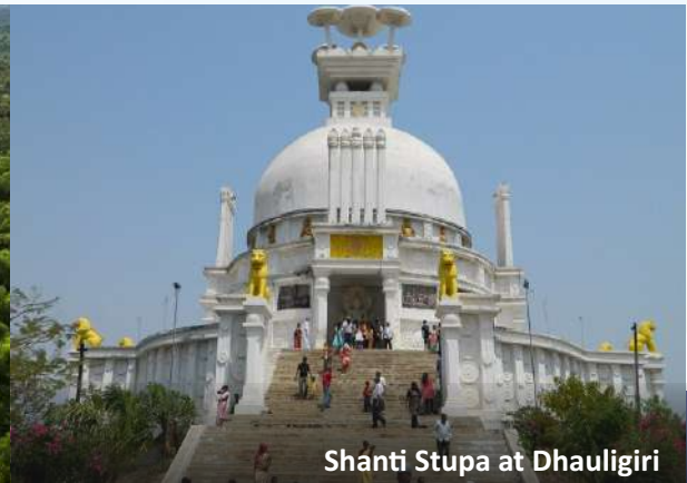
Shanti Stupa at Dhauligiri